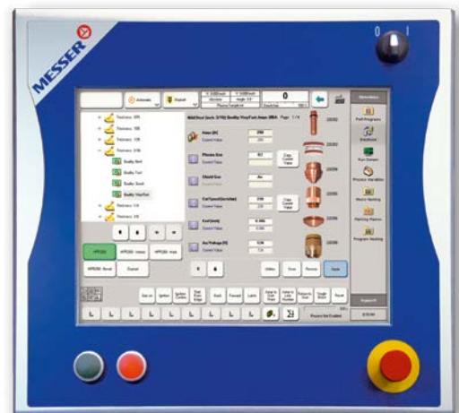
Global Control S